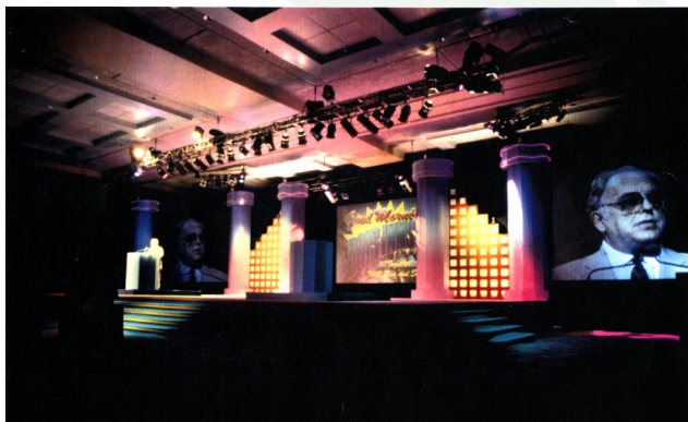
Days Inn annual meeting. Event design, production, direction.