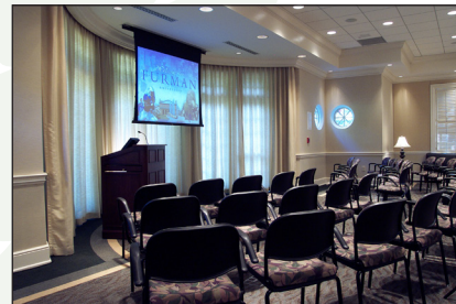
Furman University Welcome Center lobby (above) and presentation room (below). Presentation concept/design and design of interactive system design.