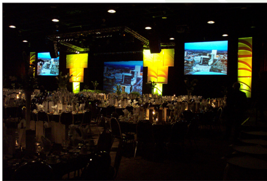
Greenville Chamber of Commerce annual meeting. Event design, production, direction.