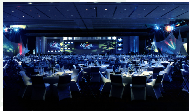
Charlotte Convention Center grand opening show.